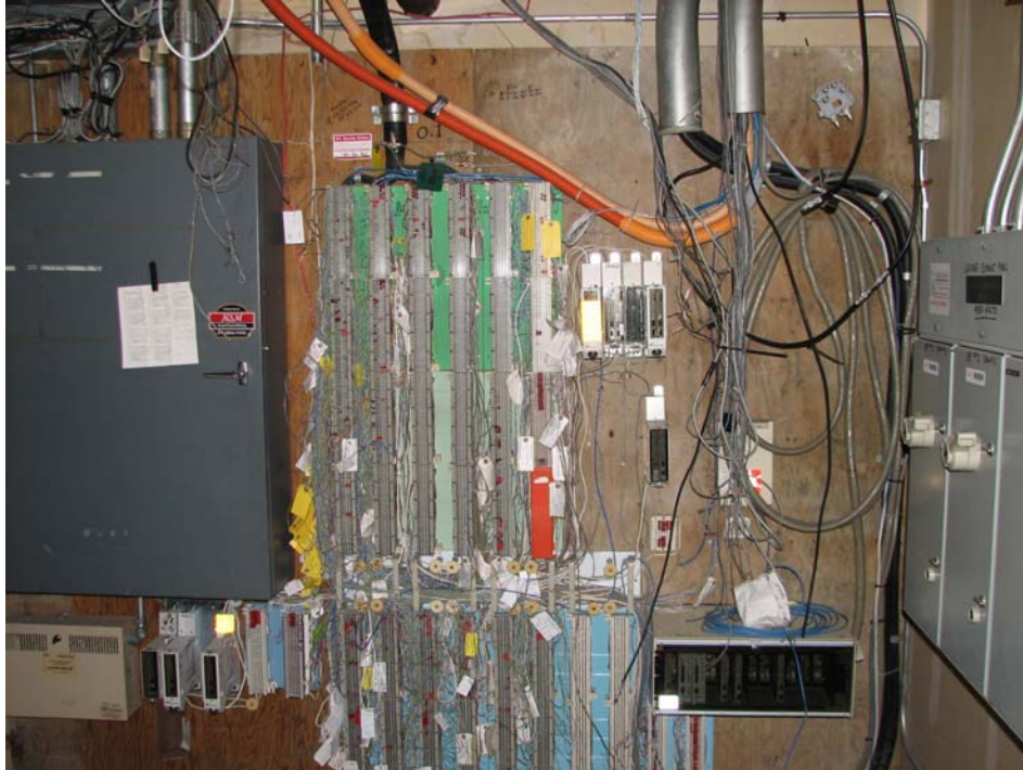
The copper termination from the “street” (LEC). Notice orange fiber innerduct which enters the MPOE from the street, passes through the MPOE and into the conduit to the building IDF.