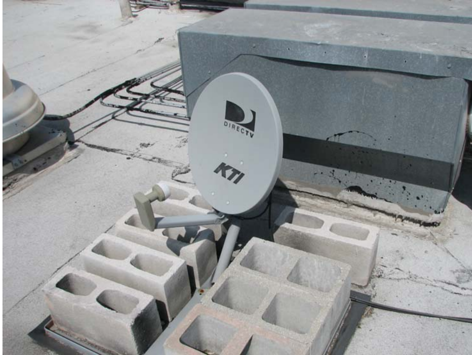
The Direct TV dish, which is located on the roof. The coax cable runs through the stacked IDFs and enters the second floor ceiling space. The final destination of the coax is unknown.