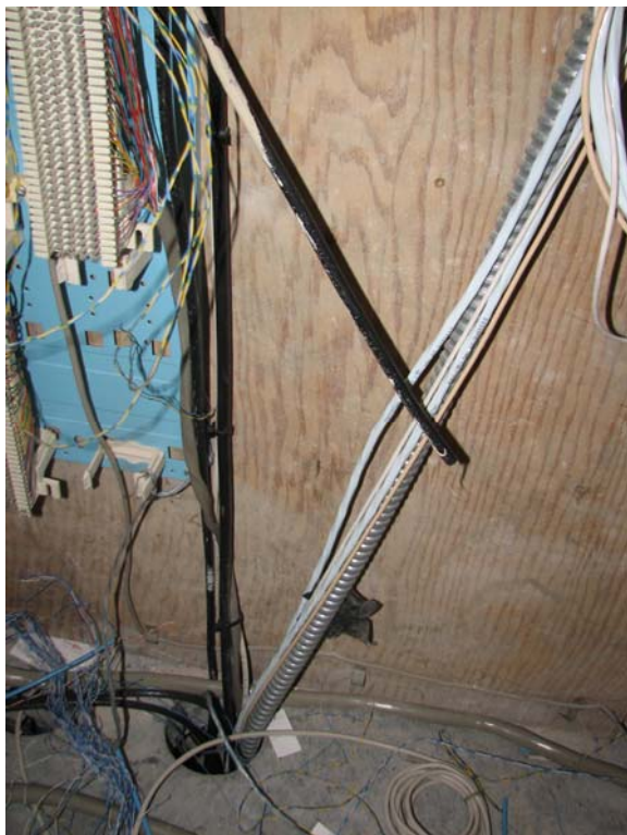
The fourth floor IDF. Note black fiber cable, which has been cut.