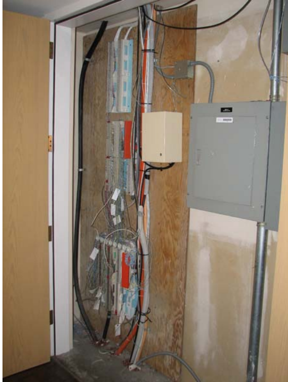
The second floor IDF. Note ivory box, which is the coax cable patch point – one per IDF. Note orange fiber innerduct.