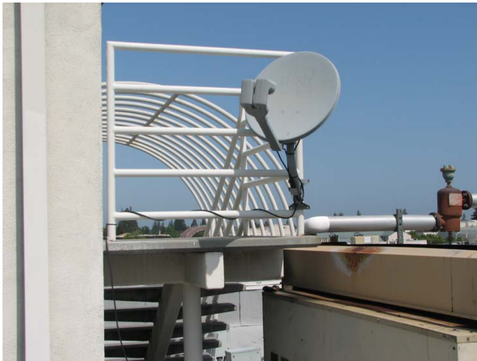
The Dish Network dish, which is located on the roof. The coax cable runs into the ceiling space above the fourth floor. The final destination of the coax is unknown.