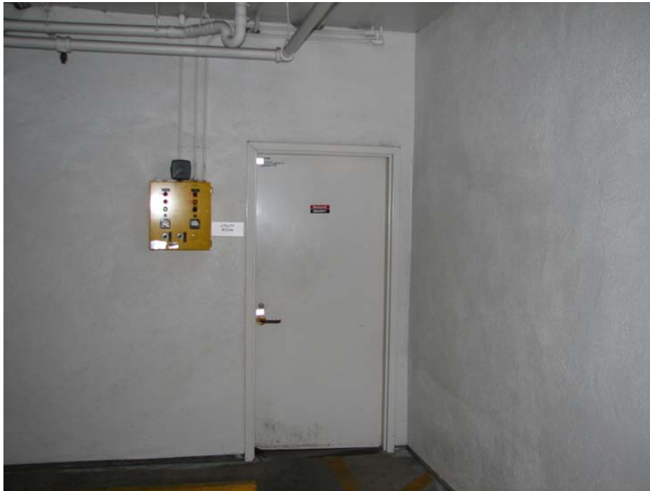
The MPOE location behind the elevators on parking level A.