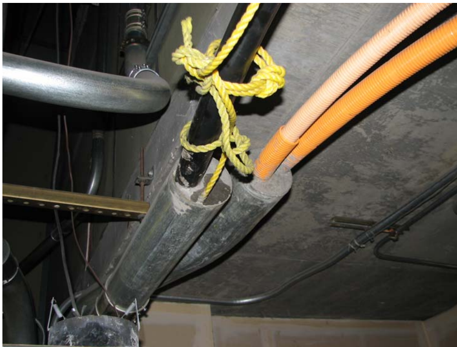
The entry point from the “street” (LEC) for the copper and fiber Telco Facilities cable.